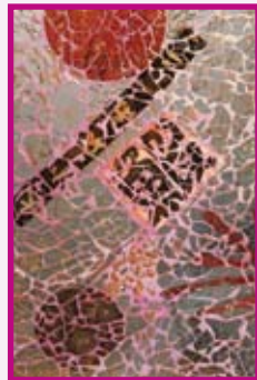
Mosaic by Ellen Blakeley

Students will design and produce up to four coasters, a small mirror frame and an ornamental garden rock.