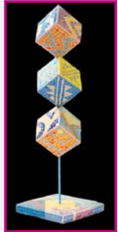
Balance by Dmitry Grudsky

In this solo exhibit Russian mosaic artist Dmitry Grudsky will exhibit new two and three-dimensional work reflecting on and exploring the concept of Balance.