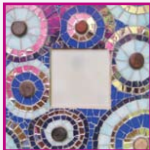
Mosaic Mirror by Lily Russo

The instructor will lecture and demonstrate proper cutting tools and adhesive needed for a variety of tesserae and substrates. Students may use the second day of class to grout pieces completed on day 1 or continue setting and return later to grout at our grout clinic. Jump start your holidays and share inspiration with classmates before the holidays get too hectic before the holidays!