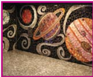
Backsplash by True Mosaics Studio

Ready to take your mosaics into the realm of the permanent installation?