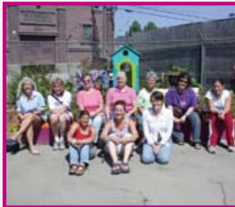
Mosaic Summer Camp