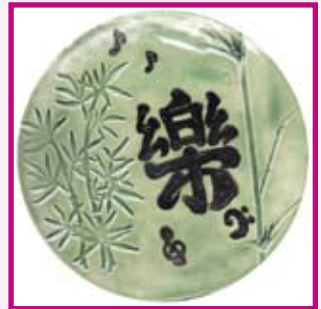
Tile by Sandra Warren

All tiles will be available for student pick-up the following week.