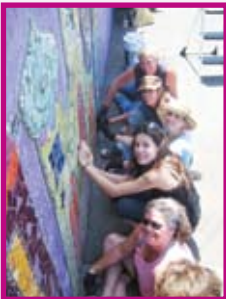
Mural Making Intensive