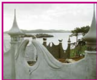
Darjit! by Brent Sumner

This course will cover the hands on building of an outdoor garden privacy wall with built in seating to create a hang out/communication area in the shape of a horse shoe with entrance columns. Class will include extensive information and demonstration of the creation of rebar, and wire armatures that will then be covered with Darjit. Students will also have the opportunity to make a small Darjit sculpture to take home with them.