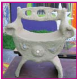
Darjit chair by Randi Casenza

Level: All • Cost: $225 • Materials: $10–$80 according to size of project