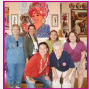
Summer Camp field trip