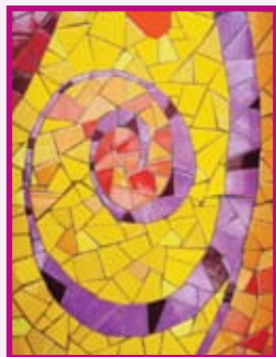
Mosaic by True Mosaics Studio

Class will begin with a presentation of professional work focusing on detail shots of projects utilizing different cutting, fitting, sawing and shaping techniques and how they fit into a large scale context. Information will include pattern making/cartooning, coding drawings and other pre-planning techniques, processing exterior-grade ceramic tile, cutting, shaping refining techniques as well as precision fitting. Dealing with mixed media will also be discussed as well as on and off site production of work.