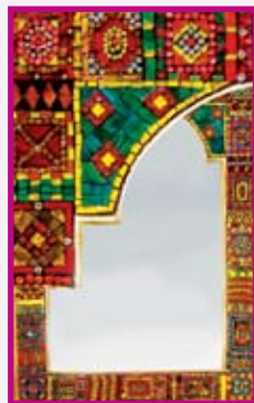
Mosaic by Laurel Skye

The embedding process offers an excellent base for all kinds of found objects to be added in as embellishments. Feel free to bring any pieces from home to help personalize your mirror.