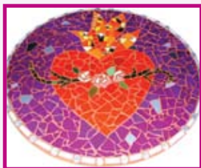
Mosaic tabletop by Lisa Wild

Prerequisite: Recommended, Mosaic 101 or Intro to Glass • Materials: $45 (for 24" diameter tabletop)