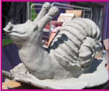
Darjit Sculpture by IMA Student

Level: Beginning/Intermediate/Advanced • Cost: $245 • Materials: $10–$80 according to size of project