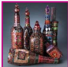
Work by Laurel Skye

Instructor will talk about design and demonstrate the use of various tools. A myriad of cutting patterns and laying designs will be explored. Instructor will also demonstrate how to wrap copper rods with wire to embed along with other tesserae to create additional textural design. This embedding process offers an excellent base for all kinds of found objects to be added in as embellishments. Students are also welcome to bring materials from home.