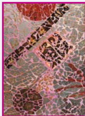
Mosaic by Ellen Blakeley

Students will design and produce up to four coasters, a small mirror frame and an ornamental garden rock.