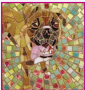
Mosaic by Tracy Broback

mosaics, use of basic mosaic tools and descriptive setting techniques. The last session will be for grout color selection and grouting.