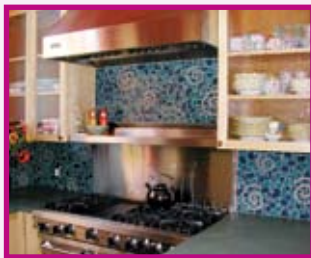
Backsplash by True Mosaics Studio

This is a lecture and demonstration-format course that focuses on wall and floor applications as well as other permanent mosaic installations. Using a mock-up of a kitchen backsplash and an existing mosaic floor installation, students are taken through the steps required to complete a successful and durable mosaic application. Class will cover choosing the proper substrate, dealing with existing substrates, prepping surfaces, work styles and prep, choosing the right materials, design for architectural applications, setting method, including use of fiberglass mesh, use of concrete-based adhesives grouting, caulking and finishing a permanent application.