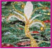
Student work by Angela Sanders

beyond. Class will explore the unique light catching and reflecting qualities of smalti and how this material can be combined with other mosaic materials for exciting and rich effects.